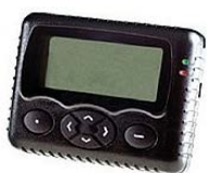
Waterproof Pager MT-WPP

Make the most out of your system by adding Pagers or DECT phones for members of Staff on the move. Handle calls promptly with Nurse Call messaging direct to Staff.