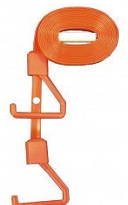
Anti-ligature Cord S64-ALPC