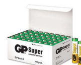
AAA Pager Batteries (x40) BAT-AAA