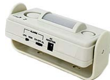
Movement Sensor S64-PIR-KIT