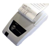
Thermal Printer PRN-T