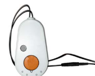
Neck Pendant (rechargeable) (2008 systems onwards)

BeltClip & Neck Pendant are available in different versions: (1) Infra Red only, (2) Radio only or (3) Combined Infra Red & Red version. Please contact us for more information.