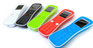
DECT Handset PK-BDH