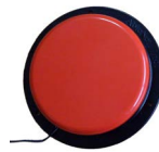
Big Red Button S64-JBS