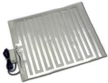
Moisture Sensor S64-EN1

To enhance your arm Nurse Call system 'Assistive Technology' devices can be plugged into the socket of the Nurse Call unit, which will provide automated monitoring & alerting via the Nurse Call system.