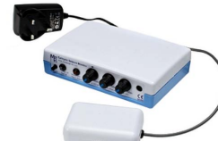
Epilepsy Sensor S64-EP1