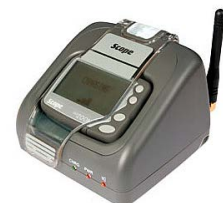
Standard Charging Unit (for Zoom Pagers) S64-ZM-CHG