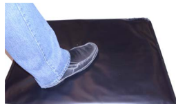
Pressure Mat S64-PRM