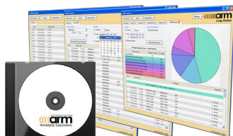
Call Logging Software S64-SWI

All events are time and date stamped for future reference either using a printer or PC software. The PC software is fully searchable and allows Management Reports to be viewed easily and printed/exported if required.