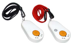
IR Fob - (rechargeable)

Infra Red or Radio Personal Alarm units can be incorporated into the system for remote signalling by service users or staff/lone workers. These portable alarm units are available in various styles: