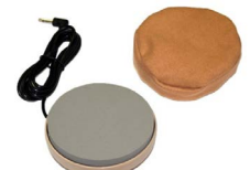
Pillow Switch S64-PWSH